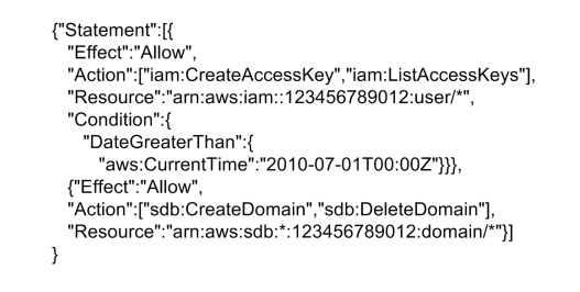
Fig. 2: Example AWS IAM policy.

To motivate the design and development of ACaaS, we analyze the access control mechanism in Amazon AWS cloud platform - a service called Identity and Access Management